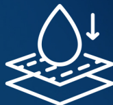
Reverse Osmosis Membrane

Reduces chlorine, chemicals, and pesticides.