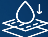
Reverse Osmosis Membrane

Reduces chlorine, chemicals, and pesticides.