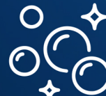
BIO-SURE PLUS™ Filter

Reduces dissolved solids, pharmaceuticals, and metals.