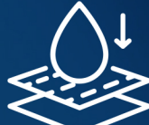
Reverse Osmosis Membrane

Reduces chlorine, chemicals, and pesticides.