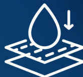
Reverse Osmosis Membrane

Reduces chlorine, chemicals, and pesticides.