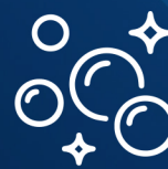
BIO-SURE PLUS™ Filter

Reduces dissolved solids, pharmaceuticals, and metals.